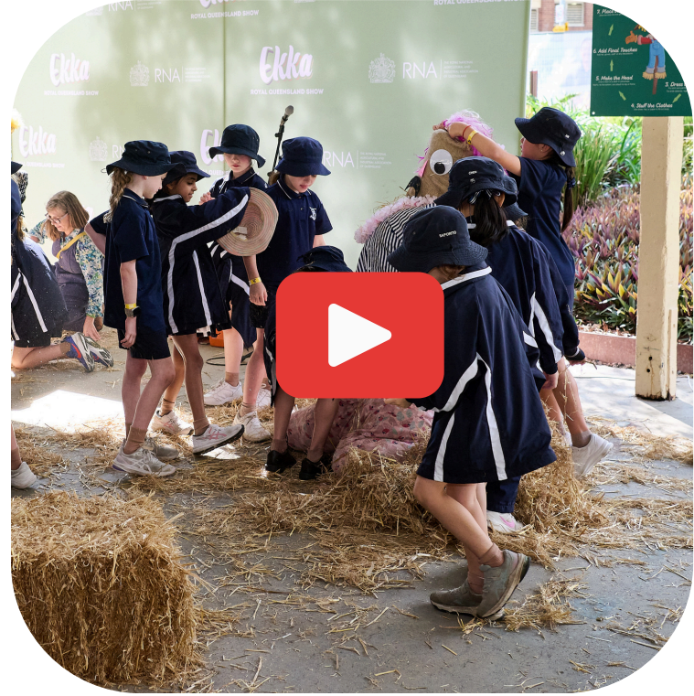
Students Learn About Agriculture | Ekka TV Rural Discovery Day 2024