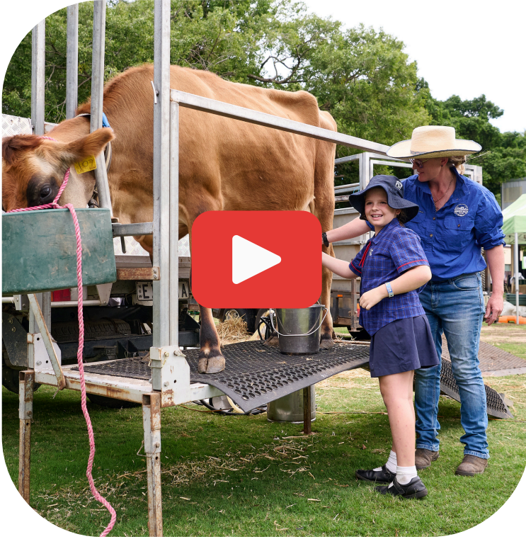
Milking a Cow: Dairy & Cream Edition