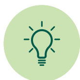
Creative & Critical Thinking