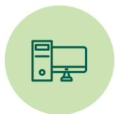
Information & Communication Technology