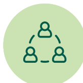
Personal & Social Capability