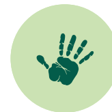
Aboriginal & Torres Strait Islander Histories & Cultures