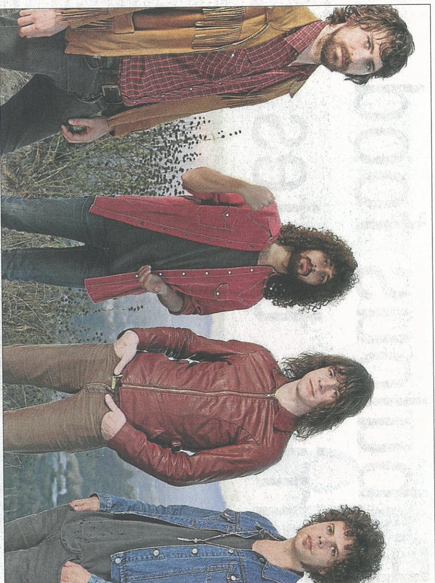
In an Ekka first, acclaimed rock band Wolfmother will perform live at the Ekka, and will be joined by popular band Grinspoon.